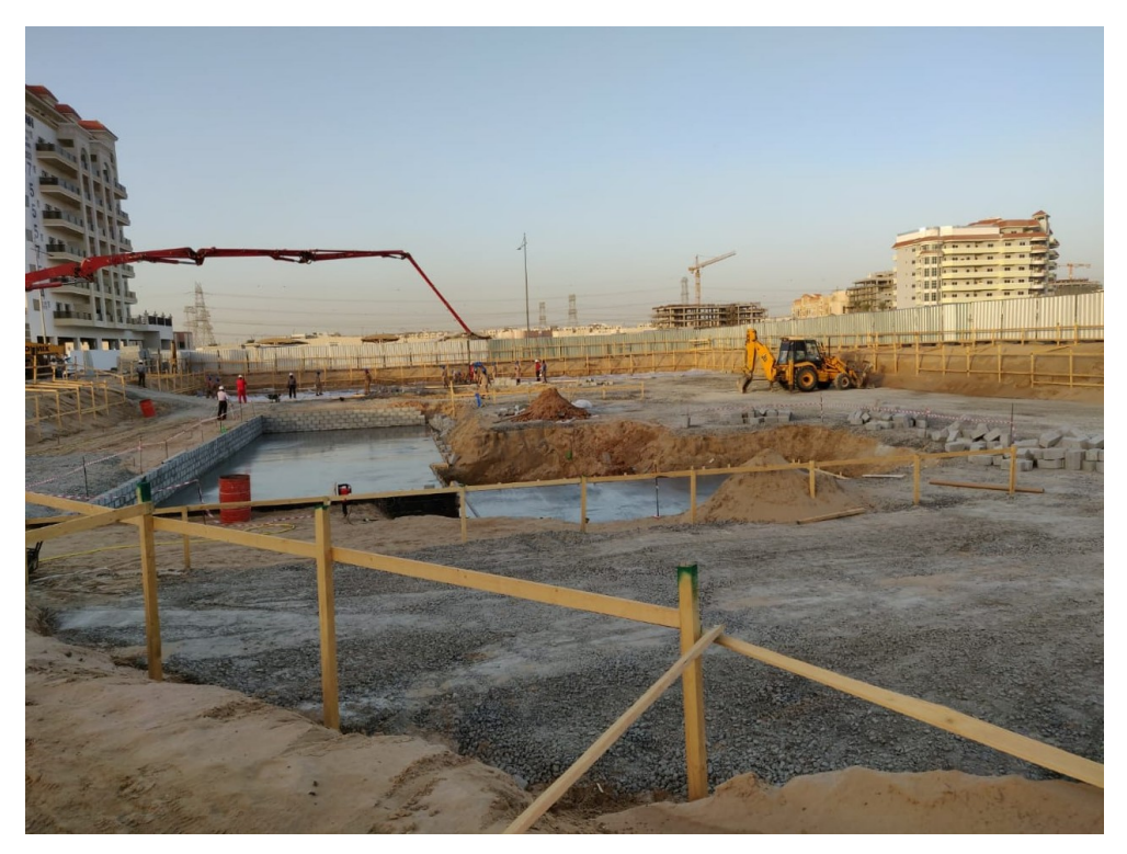
4. Underground Water tank and Pumproom Works Started